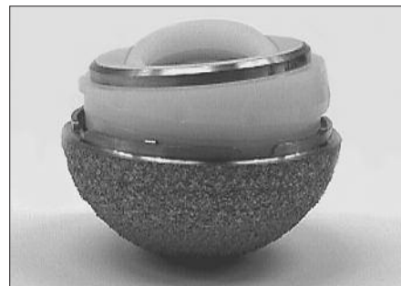
Figure 2 (10° insert shown)