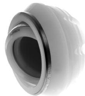
Trident® 0° All-Poly Constrained Acetabular Insert