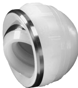
Trident® 10° Constrained Acetabular Insert