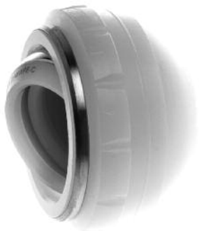
Trident® 0° Constrained Acetabular Insert