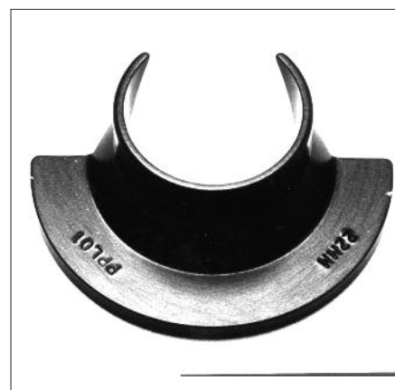
Figure 6 Head Removal Key

Removal of the constrained acetabular cup insert, if necessary, may be accomplished using a 3.3mm drill bit and a self-tapping bone screw with 3.4mm or higher major thread diameter and a round bullet tip. Rotate the bipolar component within the cup insert to